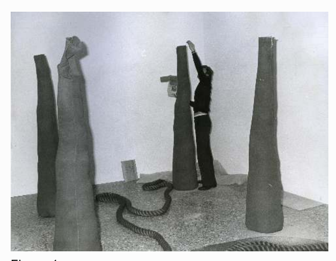
Figure 1 Installation view, Arte Inglese Oggi , Palazzo Reale, Milan, Feb.–May 1976, showing Barry Flanagan, 4 casb 2 "67, ringl 1 "67, rope (gr 2sp 60) 6 "67 , 1967, gelatin silver print, 18.5 × 24 cm. Digital image courtesy of British Council Collection archives / © Tate, London 2016."